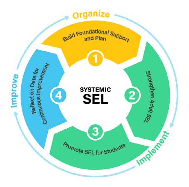
Figure 2: SEL Continuous Improvement Cycle

• Collect, analyze, and reflect on data for continuous improvement. As SEAs execute their plans, continuous improvement is critically important. Some implementation strategies will work differently depending on the population or region of the students, and state leaders need to thoughtfully reflect and improve on their implementation efforts. This should include using data SEAs currently collect or identifying new data. depending on the resources and capacity of each state. Such data may address attendance, tardiness, behavior incidents, suspensions and expulsions, GPAs, standardized test scores, access to career and workforce development efforts, school climate (i.e., perceptions of students, teachers, families, and communities through surveys or focus groups), teacher retention, educator working conditions, SEA implementation processes, professional learning, district and school implementation, social and emotional competencies, and other student-centered measures (e.g., student perception data, student sense of belonging, student attitudes and mindsets, and vouth participatory action). States should analyze and reflect on data, which should be disaggregated, to understand the experiences of different groups of students, either on their own or more likely in partnership with districts and schools.