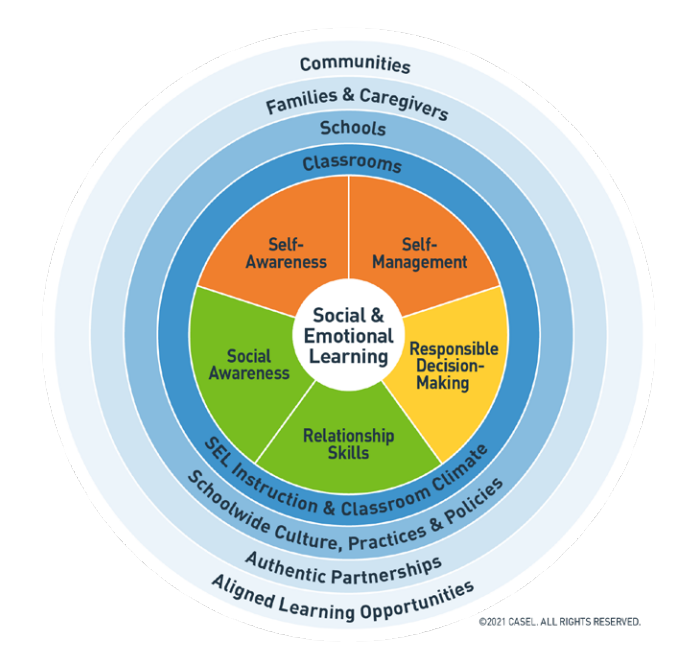
Figure 1 CASEL's Framework for Systemic SEL

As demonstrated in Figure 1, CASEL's approach to systemic SEL begins with the development of the five core social and emotional competencies and then infuses SEL into every part of students' daily life – across all of their classrooms, during all times of the school day, and when they are in their homes and communities. We believe that systemic SEL can happen at the state, district, community, and school levels —creating the conditions that optimize the social, emotional, and academic development of all youth.