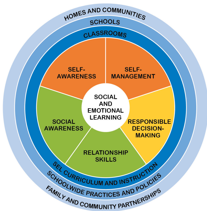
Figure 2 CASEL's Framework for Systemic SEL

The demand for state SEL policy has come from both the grass roots and grass tops. For example, extensive research has demonstrated the growing demand and support for SEL from teachers, principals, parents, employers, and policymakers. Further, the passage of the federal Every Student Succeeds Act (ESSA) in 2015 has contributed to the growing momentum in states. Although SEL is not included in ESSA explicitly, ESSA allows states to define student success more broadly than academic achievement. In addition, ESSA allows states to use some funds for SEL-related efforts. For example, states can use Title I funds for evidence-based programming in SEL; Title II, Part A for professional development; Title IV, Part A for whole child efforts; and Title IV, Part B for afterschool programming (ASCD, n.d., and Grant, Hamilton, Wrabel, Gomez, Whitaker, Leschitz, Unlu ... 2017).