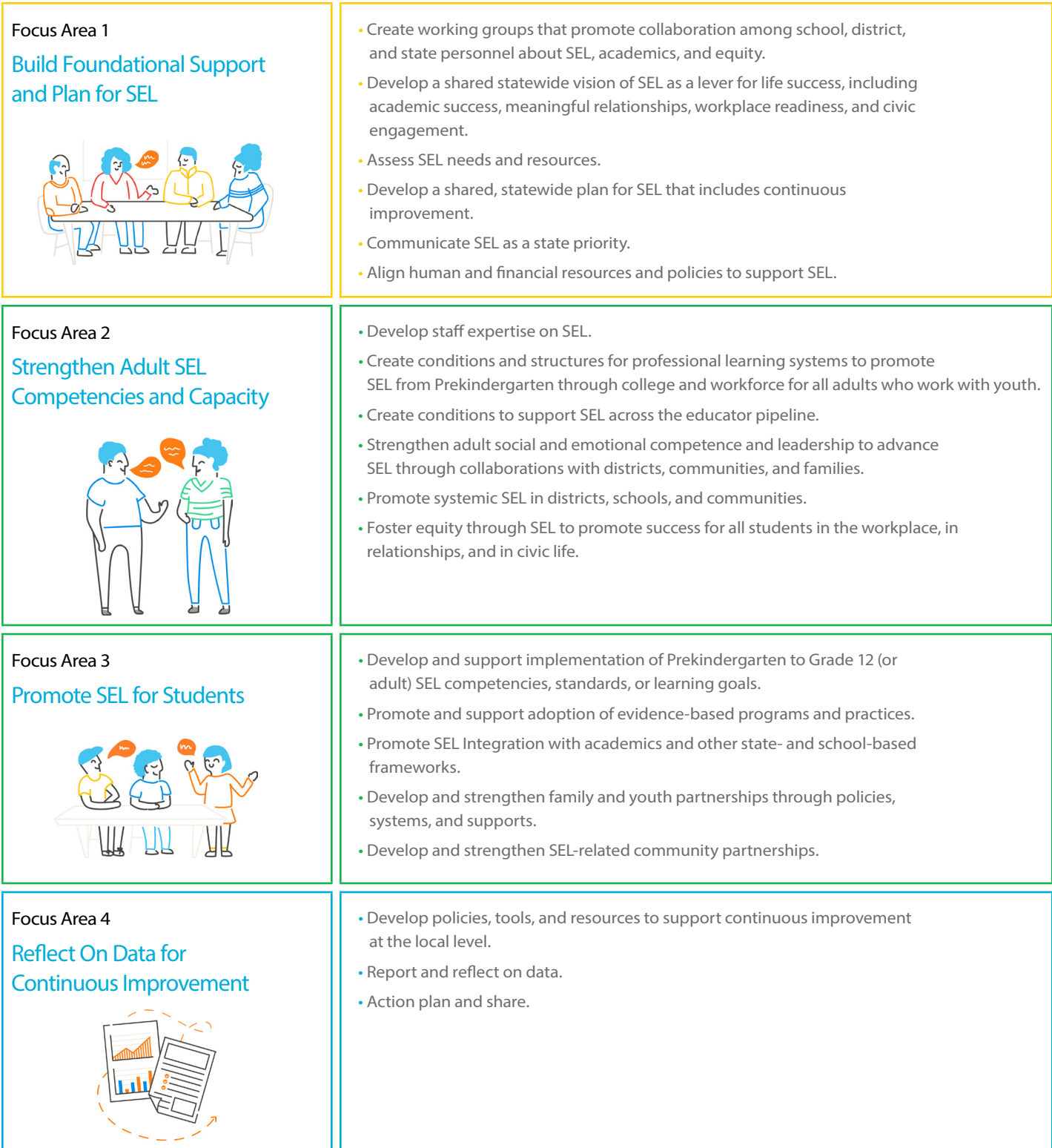
Figure 5 State Theory of Action focus areas and key activities