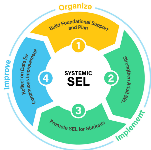
Figure 6. Process of Continuous Improvement within Systemic SEL

SEAs currently collect or identify new data sources for this work, depending on the resources and capacity of each state. Such data may address attendance, tardiness, behavior incidents, suspensions and expulsions, GPAs, standardized test scores, school climate (i.e., perceptions from students, teachers, families, and communities through surveys or focus groups), teacher retention, educator working conditions, SEA implementation processes, professional learning, district and school implementation, social and emotional competencies, and other student-centered measures (e.g., student perception data, student sense of belonging, student attitudes and mindsets, and youth participatory action results). States should reflect on their data and how it is being used, either on their own or more likely in partnership with districts and schools.